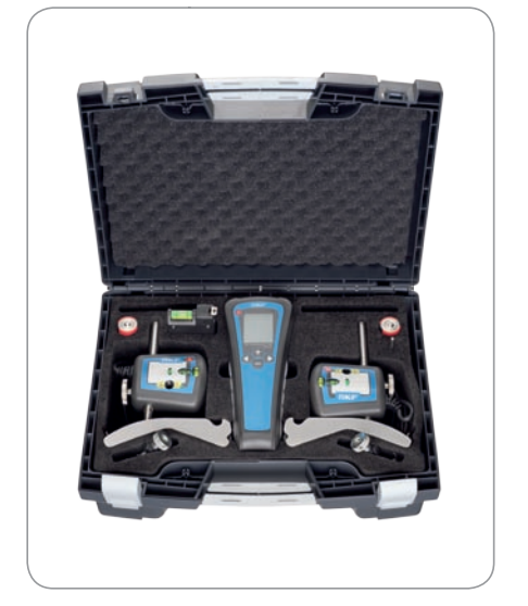
® SKF is a registered trademark of the SKF Group.