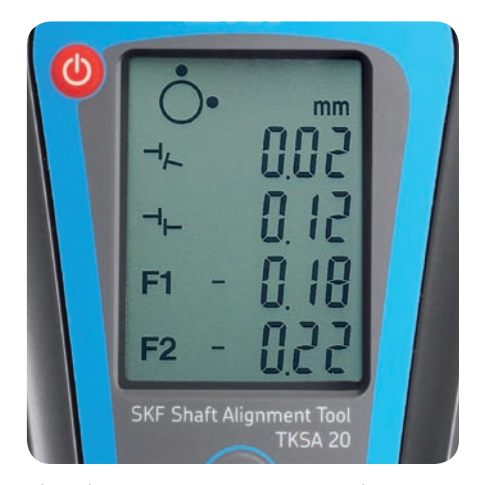
Live alignment results makes corrections easy